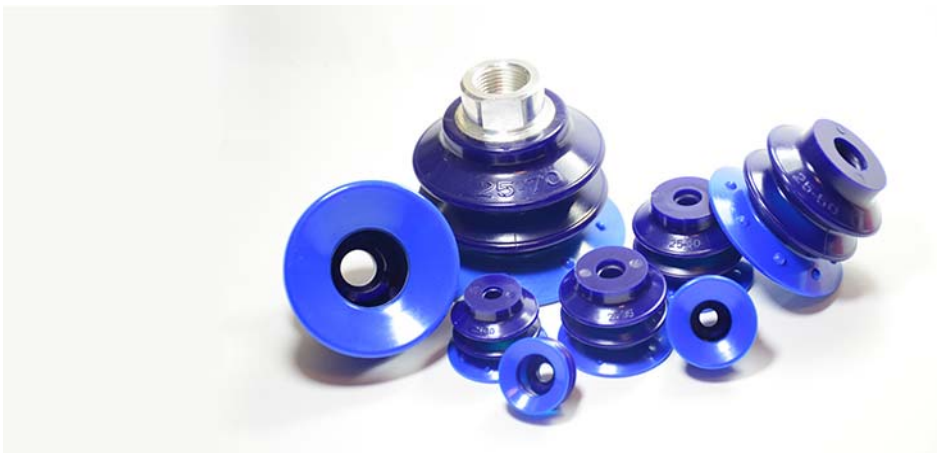
Flexy Standard Cups 2.5 Bellows Family